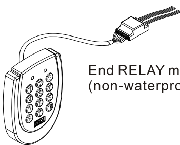
End RELAY module (non-waterproof)